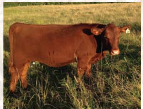
Right: Progeny of Red Lazy MC Honky Tonk 11X