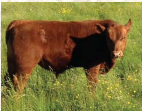
Left: Progeny of Red Lazy MC Spyder 149A